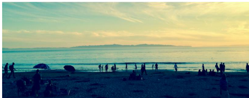
Channel Island Intergroup Presents: In Person Big Book Study Retreat • October 14-16

See OACIIG.WORDPRESS.COM for a list of recovery events and check the host site for on-demand recordings.