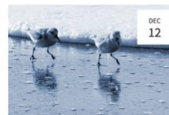
Virtual Relapse & Recovery Event - SAVE THE DATE

Monday, December 12, 2022 6:30 PM - 8:00 PM