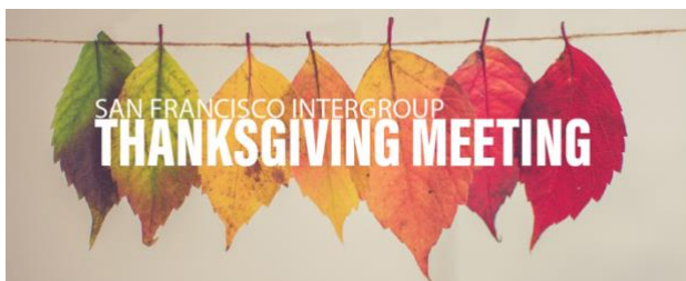
In Person Thanksgiving Meeting: San Francisco