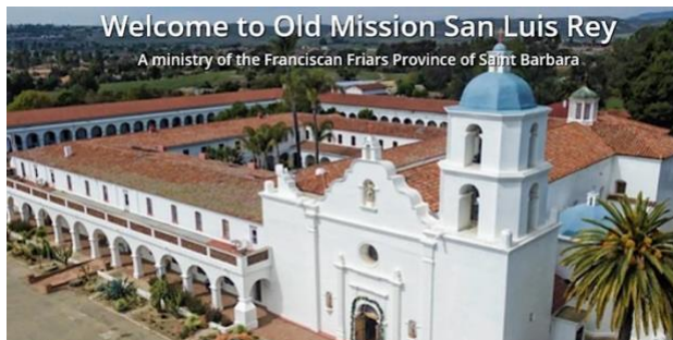
OA Men's Retreat: Oceanside Nov 4th